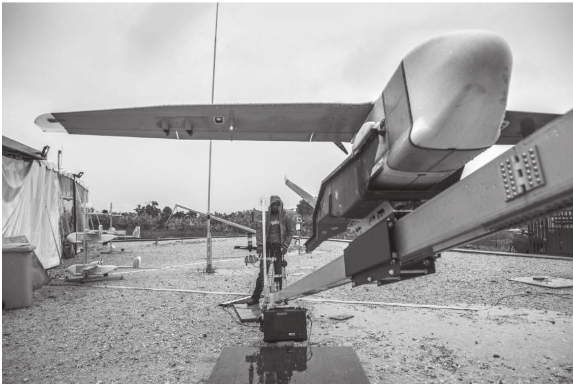
Figure 1: A drone prepares for launch, Rwanda

A text message alerted the local doctor treating Alice just before the drone arrived. The drone spiraled down to an altitude of about 10 metres, using onboard sensors to measure the wind and judge the right speed and direction for the final approach before releasing its package (see Figure 2 ).